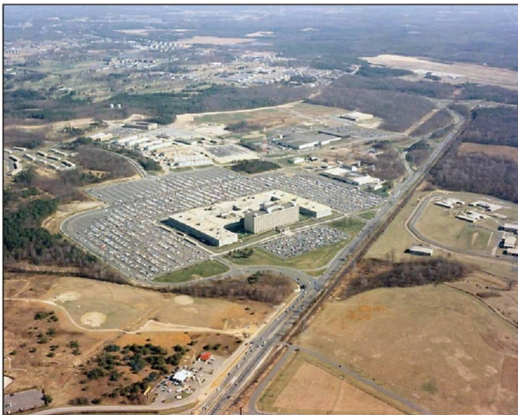
NSA headquarters, Fort George G. Meade, MD, in the 1970s

This is the NSA I knew in 1966-68 with the taller 9 story building completed in 1963. The rows of paired building at the 11:00 of the NSA building are the barrack for the Army, Navy, Air Force and Marine military working at NSA. They are still there today but have been refurbished.