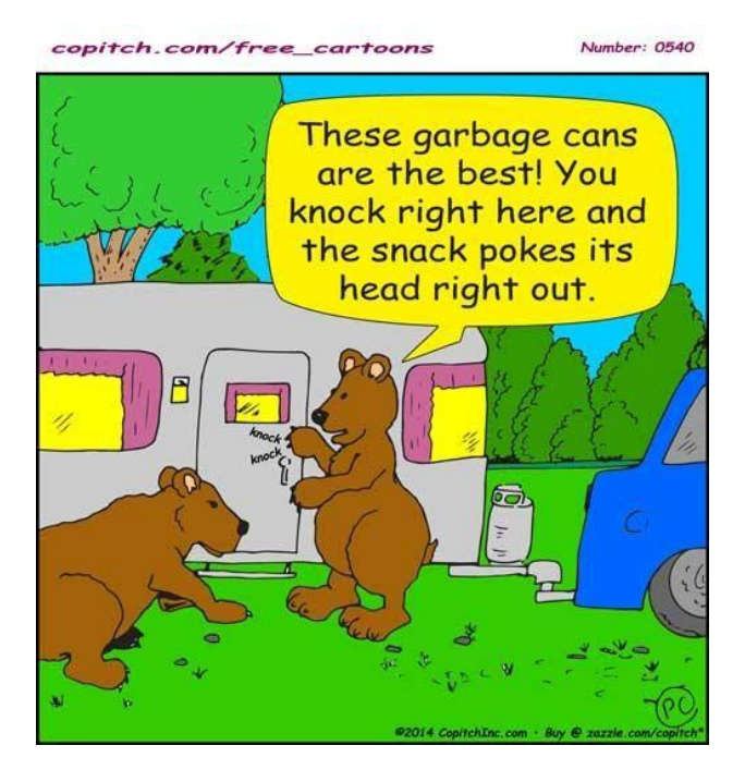
Yes, the holiday camping season is closing!

Finally, since this is near the end of the "official" summer this month, I thought I'd add this cartoon: