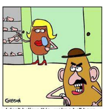
I don't believe this...we're a half hour late for the dinner party and you're still picking your nose!