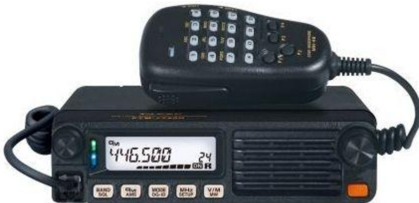
C4FM /FM 144/430MHz Dual-Band Digital Mobile 50W C4FM/FM Dual-Band Digital

KJI has confirmed they will be attending the Hamfest and RWAntenna is still checking on their availability. We have some great door prizes including HT's, cash prizes, electronics toolkit, ARRL gift certificate and the GRAND prize Yeasu FTM7250DR mobile rig.