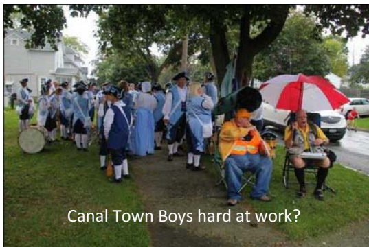
Canal Town Boys hard at work?