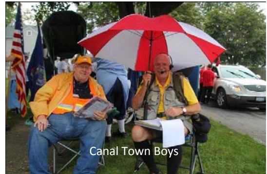
Canal Town Boys